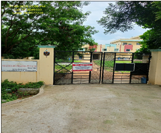
Physical Location: Outside of the Firm