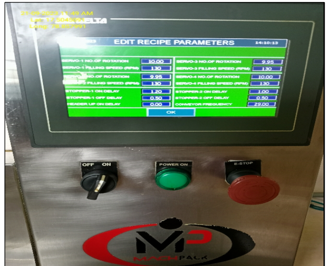
Quality Check Process