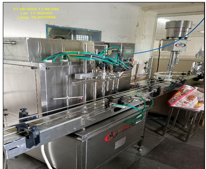
Critical Machine for Production