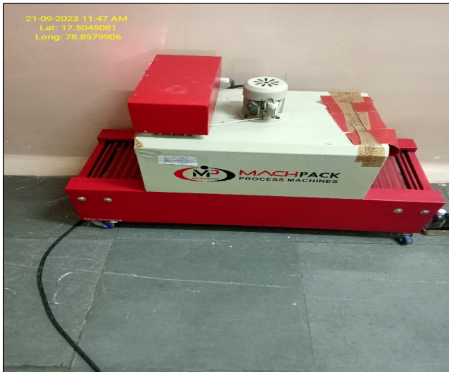
Critical Machine for Production