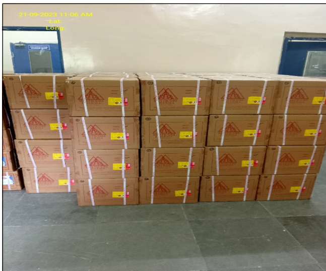
Safe Packaging for Defect Free Delivery of Products