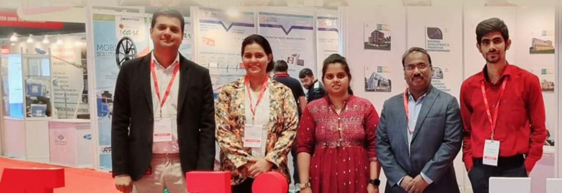
Medical Expo 2023 (Kolkata)